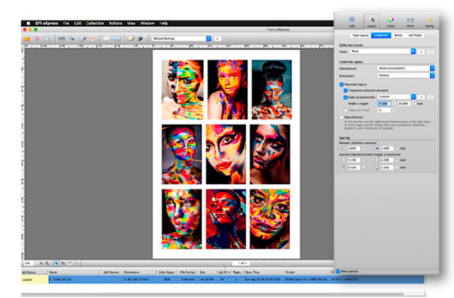
Create contact sheets in just a few clicks

The solution automatically configures photo collections (single- and multi-image templates), plus contact sheets to save you time and media for image evaluation and approval. It provides image management tools to easily convert to grayscale, honor incoming RGB profiles, and it fully supports EXIF data. Moreover, the solution provides color and printing presets with an intuitive and simpler "everyday work mode" for faster processing of common tasks and higher productivity. The included EFI Unidriver allows multiple users to remotely control RIP settings as easily as using a simple printer driver.