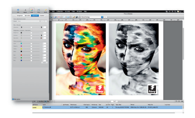
Color manipulations that guarantee the desired result

Do last-minute color adjustments or edit spot colors for the desired final result. The job-based optimization feature allows sub-optimal paper profiles to be easily adjusted to improve output quality.